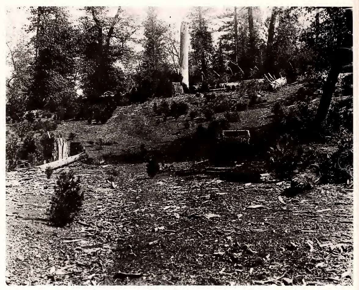
FIG. 4. El Dorado county, 1899. Forest logged out 5–6 years ago. Sugar pine ( Pinus lambertiana ), large ponderosa pine ( Pinus ponderosa ), Douglas-fir ( Pseudotsuga menziesii ) taken out, Kellogg oak ( Quercus kelloggii ) and incense cedar ( Calocedrus decurrens ), 12–25 per ha., remain (5–10 per acre). Reproduction of incense-cedar, ponderosa pine, white fir, and Douglas-fir abundant 2–9 m high (6–30 feet), 2–8 years old. Ground grazed. Half mile south of Blairs Mill at Sly Park. Humas 4–10 cm deep (2–4 inches). Soil deep brown, sandy loam.

have also led to an increase in tree densities in Sierra Nevada forests.